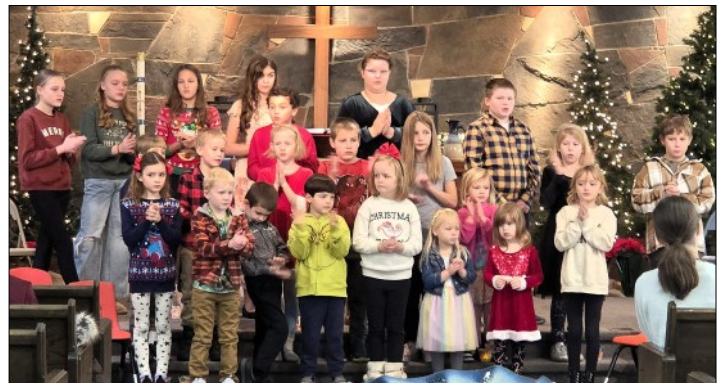
All God's Children Christmas Program December 14, with Bible Quest & Trinity Youth.