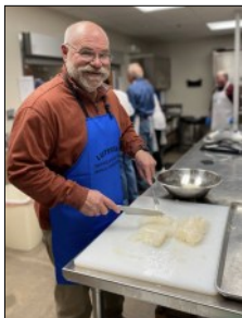
It takes teamwork to get to the finish line...