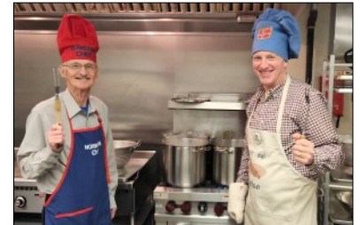
The chefs in the kitchen, slaving over a hot stove.