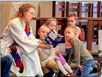
Children's Sermons with the Synod Staff