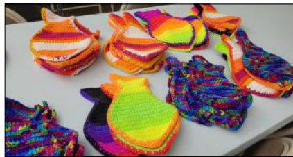
Thanks to Patti Naughton for the colorful fish for each of the kids.