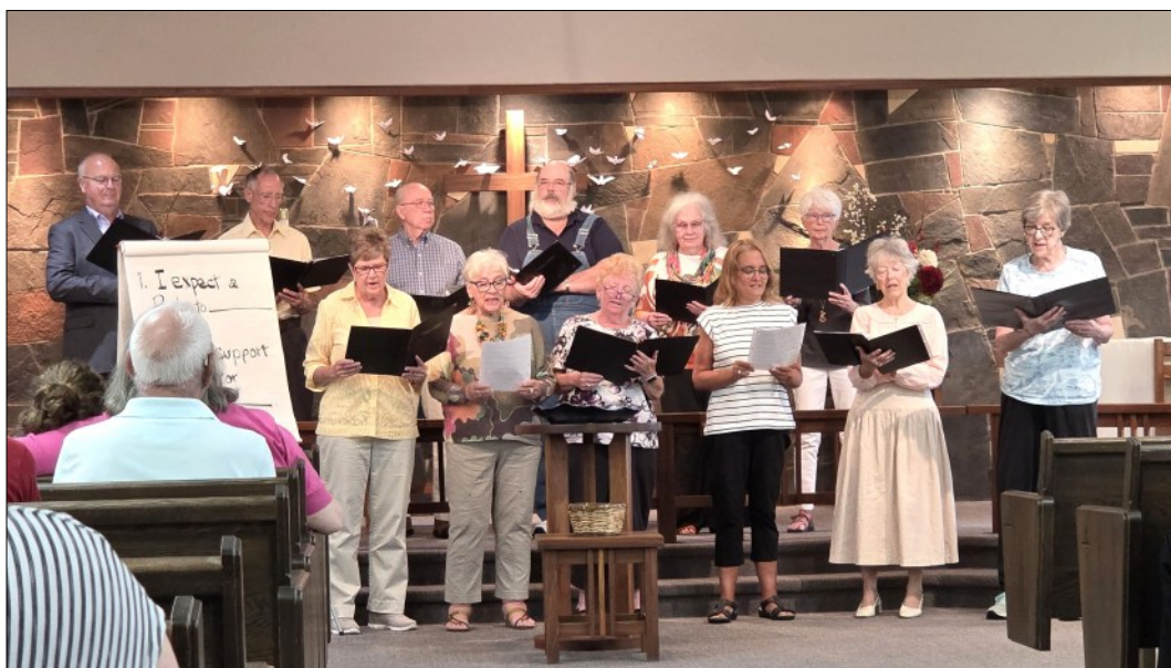
"Pop-Up" Choir performing on Sunday, June 29. Thanks to all participants.

If you enjoy singing but are not able to commit to weekly choir during the year, this is your opportunity! The next opportunity to "pop up" is Sunday, August 3!